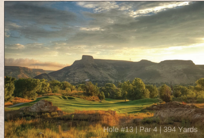
Hole #13 | Par 4 | 394 Yards